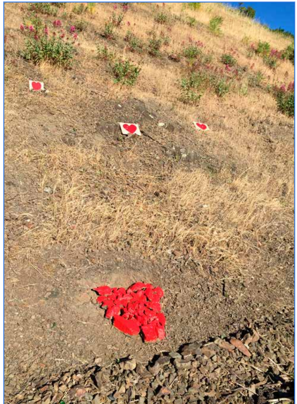
The hearts along Diamond Heights Boulevard.