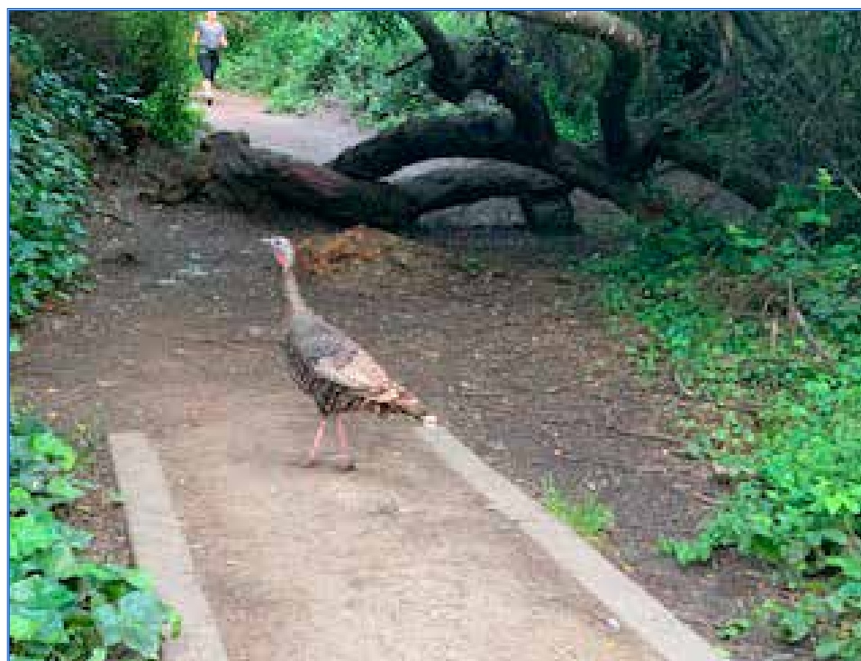
A wild turkey walks in Glen Canyon.