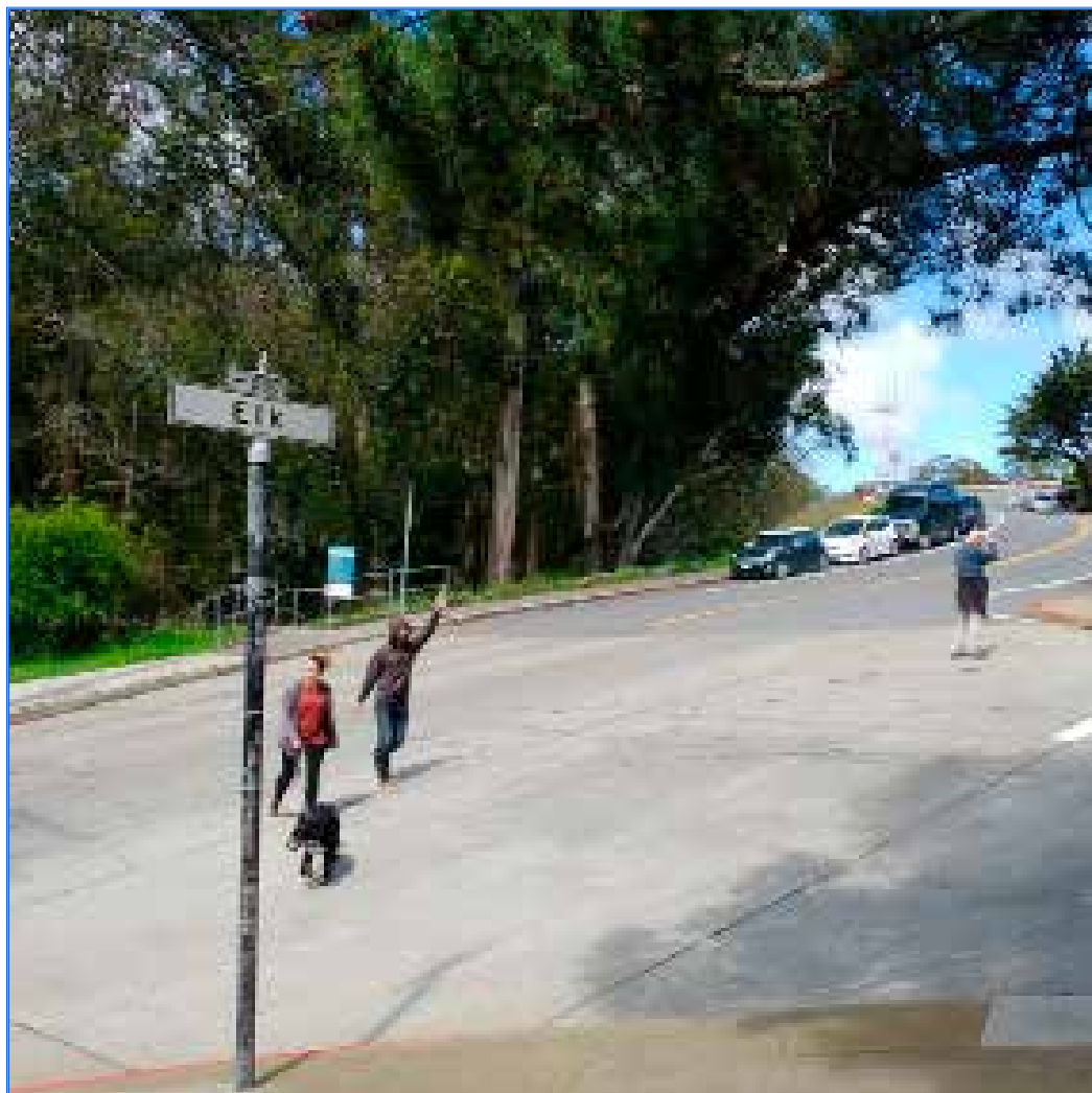
The intersection of Elk and Sussex streets, where construction of a pedestrian-activated flashing beacon is scheduled to begin later this year.